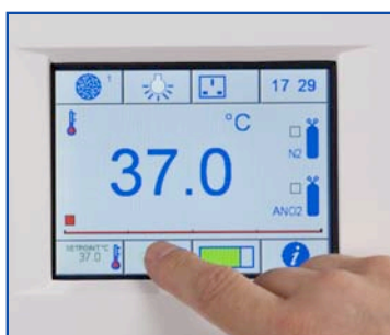
Intuitive operational software accessed via a full colour touch screen interface