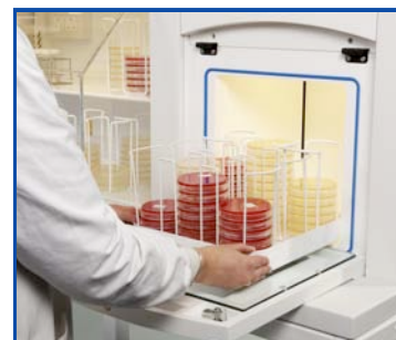
30 litre airlock for bulk sample transfer, accommodating 90 x 90mm Petri dishes