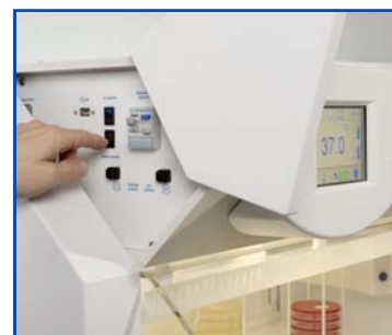
Supplementary controls are located behind a rotating cover