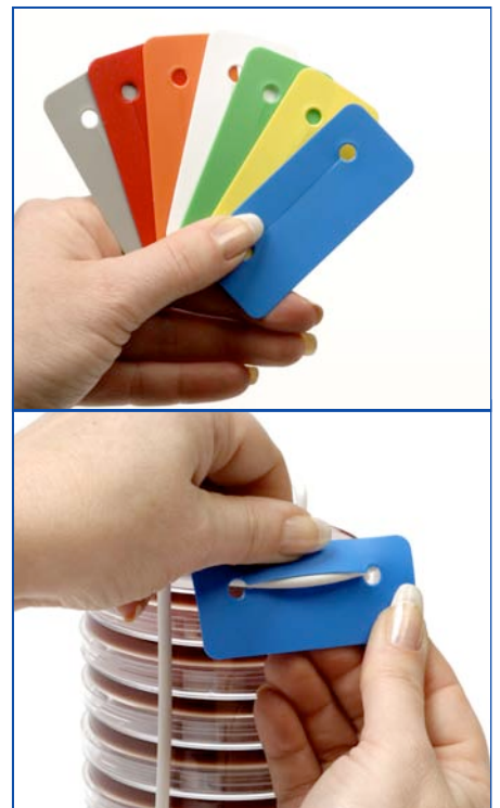
Basket Tag Set