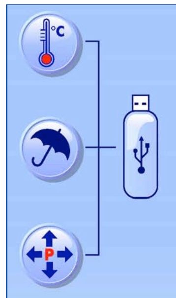
Convenient USB memory stick download of temperature, humidity and internal pressure parameters