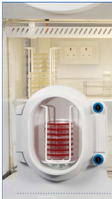
Each porthole is also a mini-airlock. Up to 40 x 90mm Petri dishes can be transferred at the same time as an operator's hands are inserted or withdrawn from the chamber